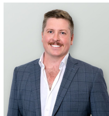
Harry McKinnon 66874447

Type : Townhouse Land Size : 253 sqm View : https://www.byronbaypropertyvalues.com.au/sale/nsw/northern-rivers/byron-bay/residential/townhouse/8677116