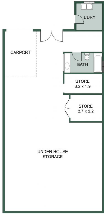
LOWER GROUND FLOOR : 135m 2