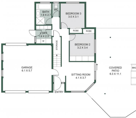
GROUND FLOOR : 98m 2