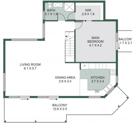
FIRST FLOOR : 93m 2